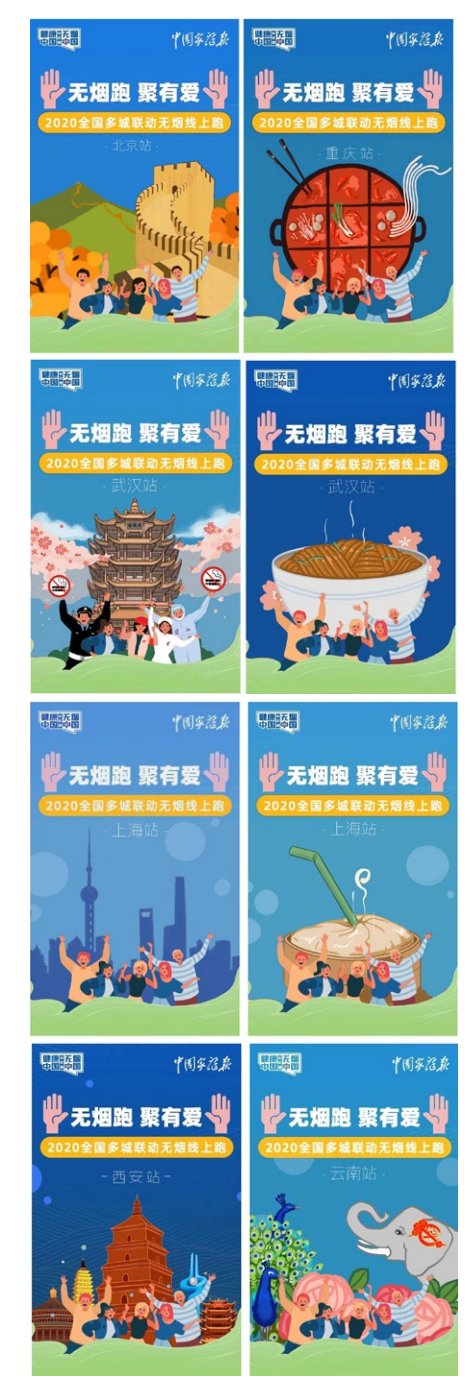
A collage of smoke-free run posters from eight different cities across China

In 2020, the prime minister signed a decree that increased sanctions for violating smoke-free health laws.