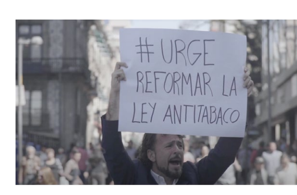
From the PSA "How Do I Explain it to You?"

Materials from the Vietnamese campaign focusing on enforcement of smoke-free cafes.