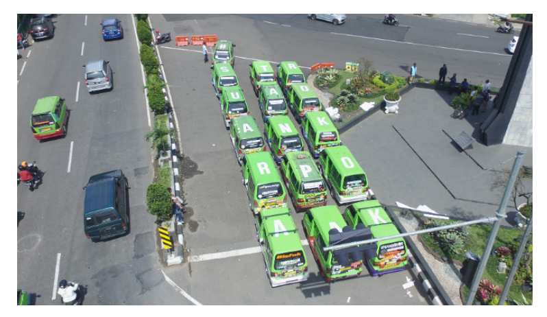
A campaign using minibuses in Bagor.