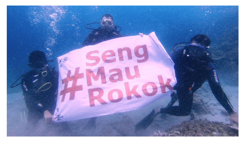
Vital's #SengMauRokok campaign goes to all corners of Indonesia including the depths of the ocean to fight for tobacco control.